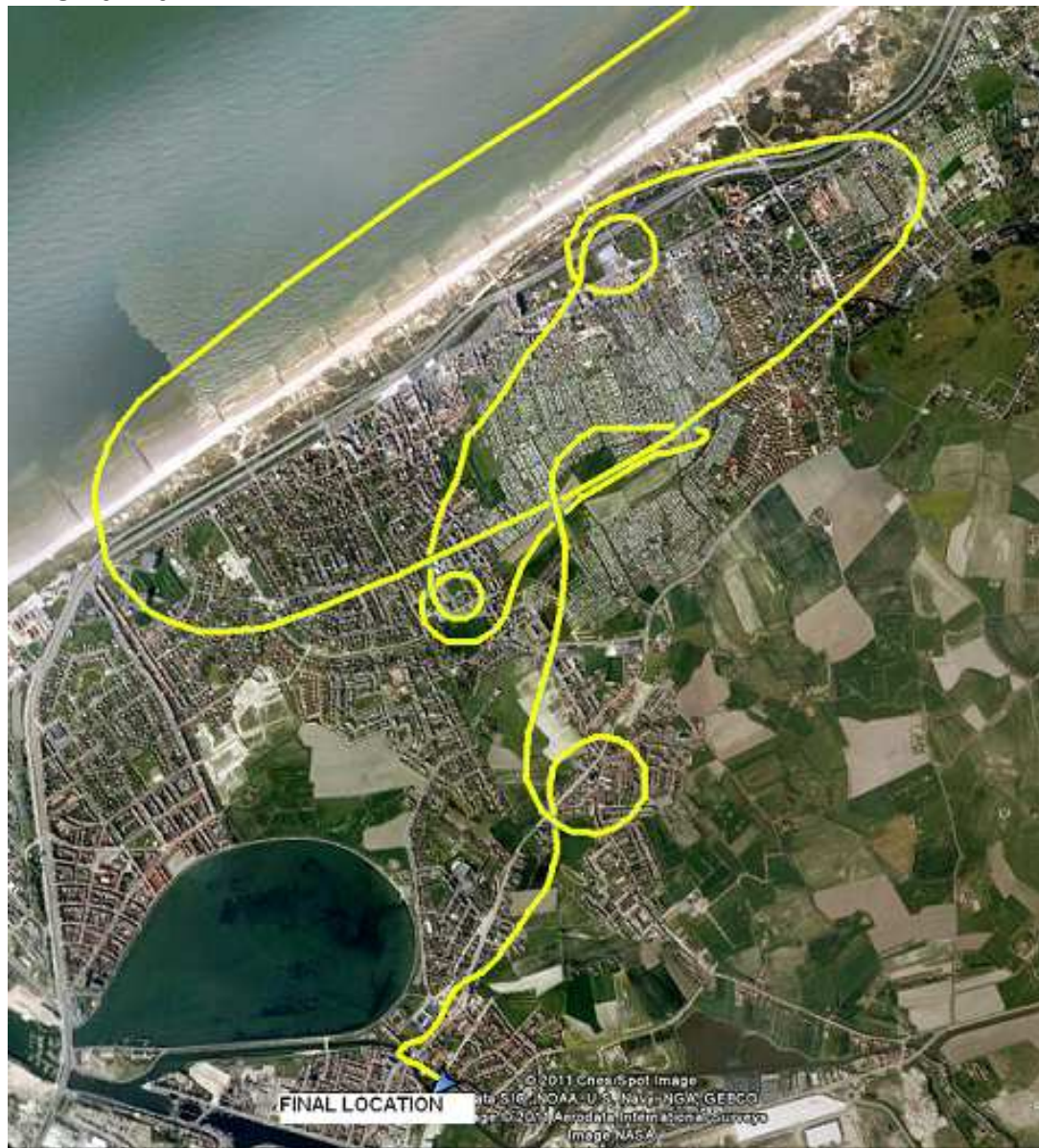
Flight track above Bredene city