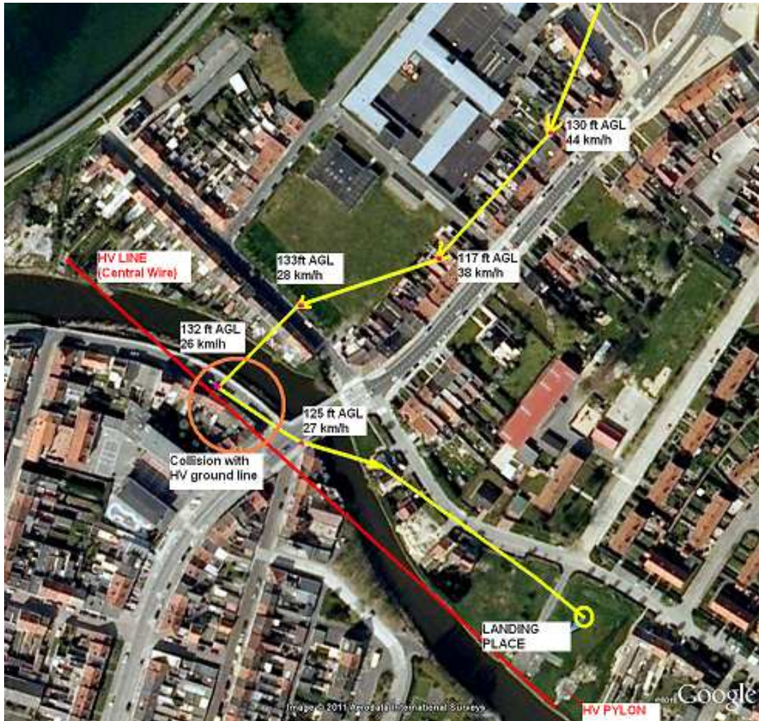
Flight track in the vicinity of the HV Line