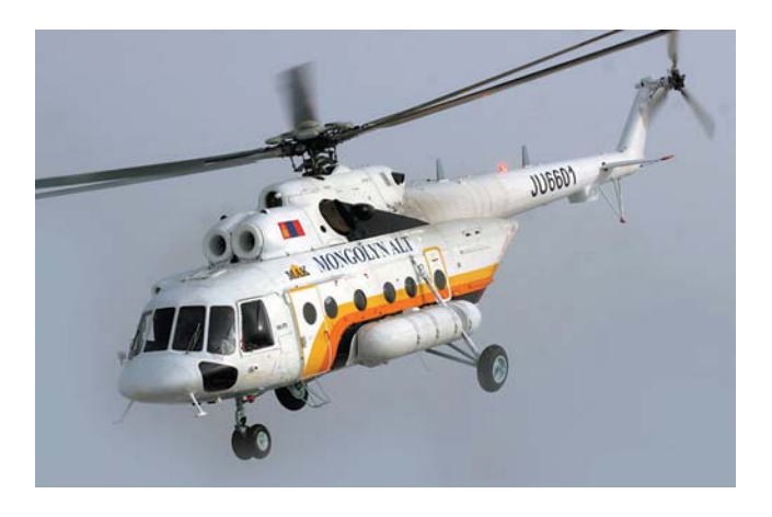
Above: The Ulan Ude Aviation Plant has recently carried out flight training courses for the Mongolyn Alt Corporation, which operates two Mil Mi-8/17 helicopters. UUAP recently delivered its 850th aircraft in this series.

• Russian Helicopters have begun deliveries of 20 Kamov Ka-32A11BC multirole helicopters to the Sino-Russian Helicopter Technology Company in Quingdao, China. Two aircraft are already in service, with four more due to be handed over by the year end and further deliveries through 2015 and 2016.